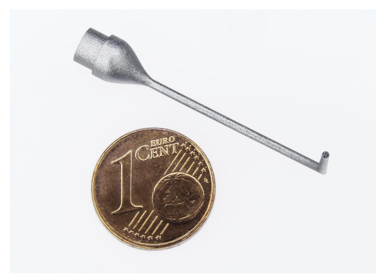
Abbildung 2 - Additively manufactured flow measurement probe from 3D MicroPrint

Micro Laser Sintering with 3D printing systems from 3D MicroPrint opens up new design possibilities in component design. This technology enables innovative applications in the field of microfluidics, optimized flow properties and function integration and thus completely new possibilities for our customers. By using Micro Laser Sintering technology, excellent mechanical properties and a high level of detail accuracy are achieved on the filigree flow measurement probes. Due to the production from only one part, assembly times are eliminated and the product is robust and durable even in harsh operating conditions.